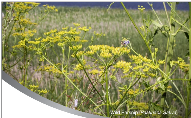
Wild Parsnip ( Pastinaca Sativa )