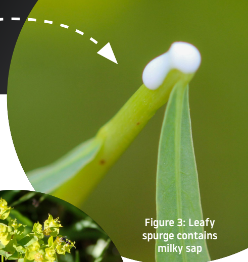
Figure 3: Leafy spurge contains milky sap