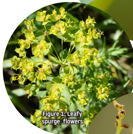
Figure 1: Leafy spurge flowers