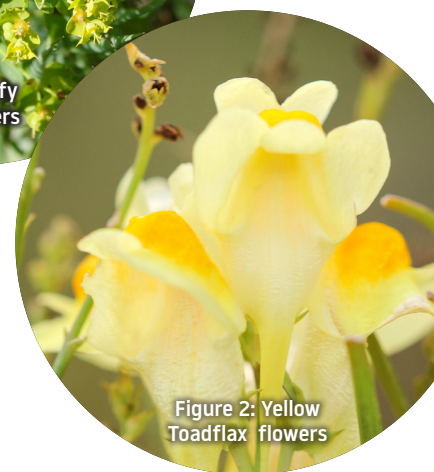
Figure 2: Yellow Toadflax flowers